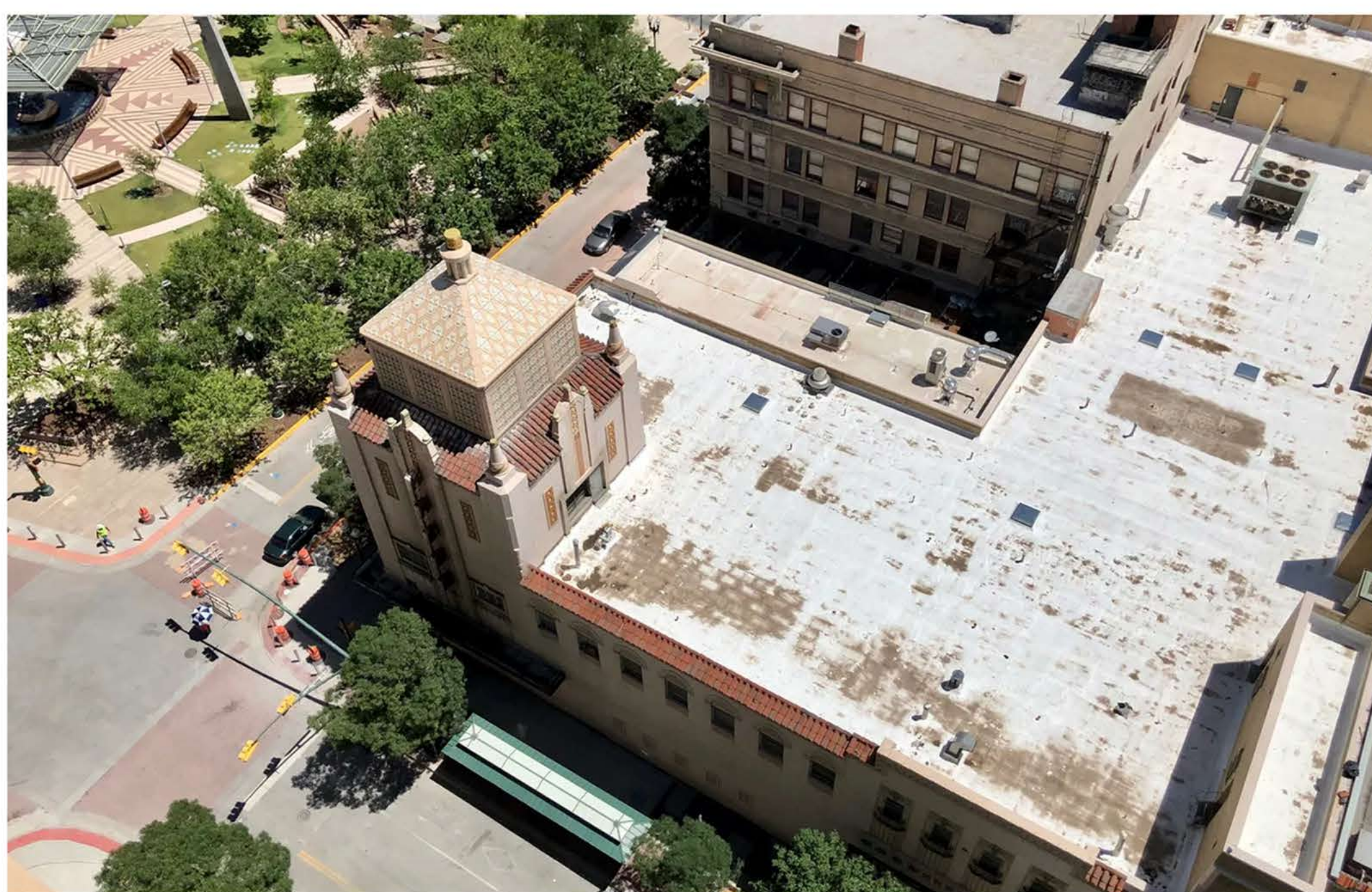
The historic Kress Building's L-shaped configuration can be seen in this view from the adjacent Plaza Hotel Pioneer Park's patio roof as seen on June 17, 2020.

It has entrances on Mesa Street as well as on Oregon Street and Mills Avenue.