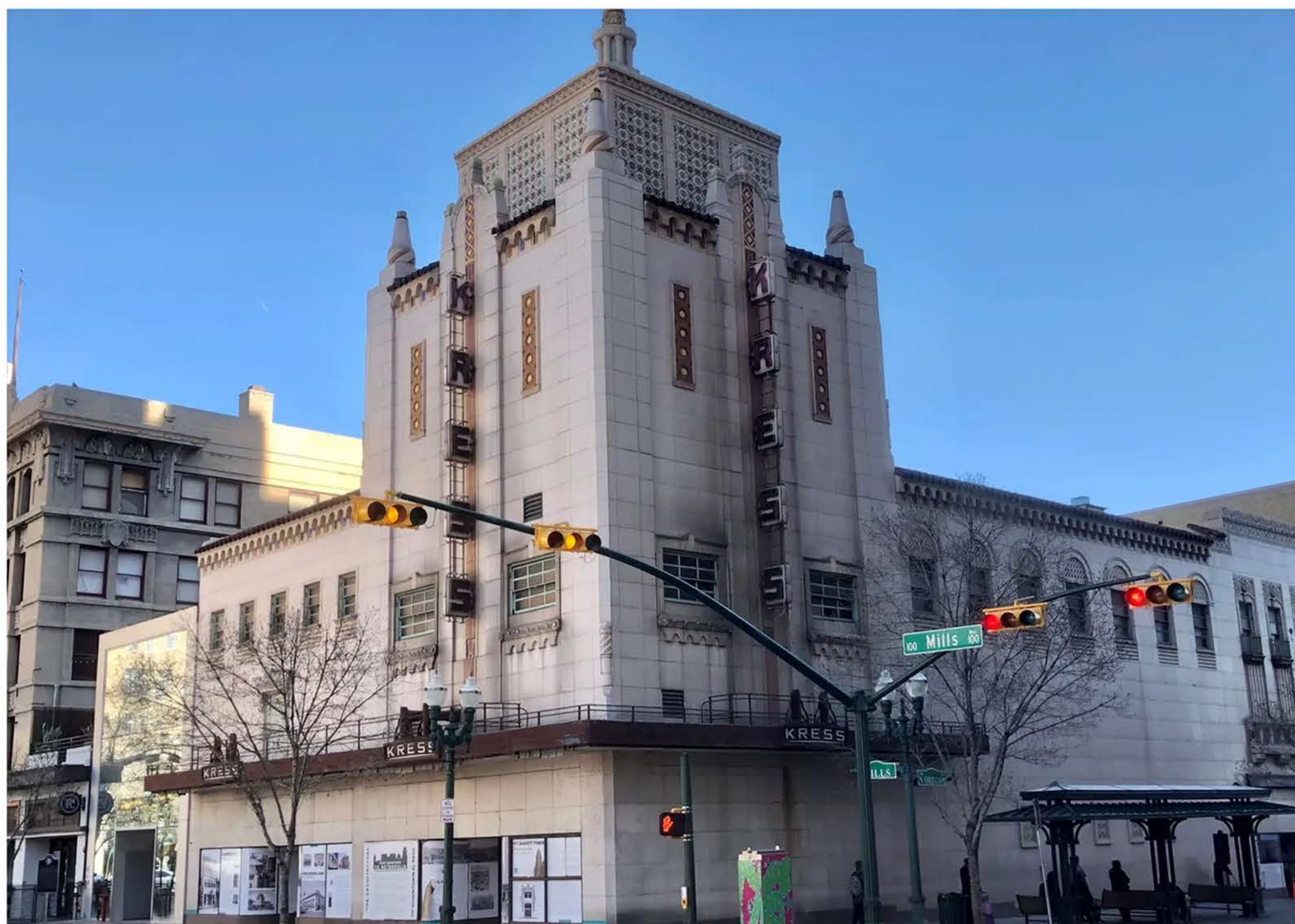
The historic Kress Building at Mills Avenue and Oregon Street in Downtown El Paso is shown on Jan. 24, 2019.

The distinctive art deco building, a former Kress department store, is located at Mills Avenue and Oregon Street, directly across from San Jacinto Plaza.